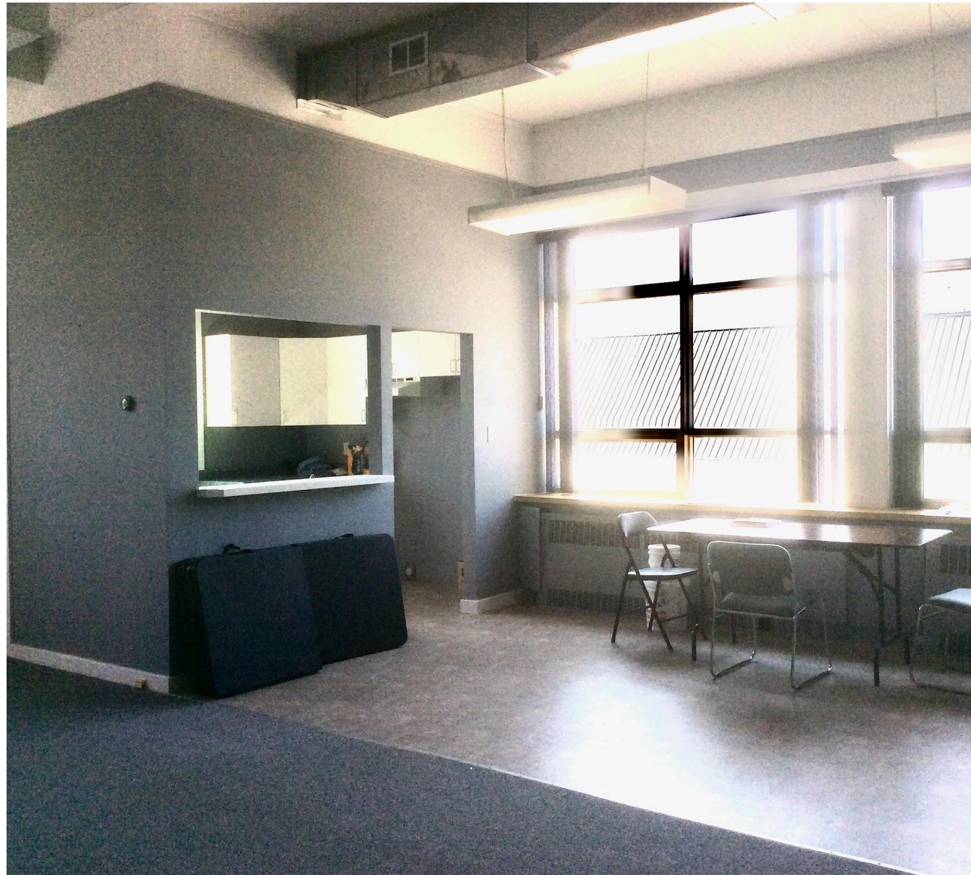
West side of building with kitchenette

The former dentist's suite can easily be modified for display space